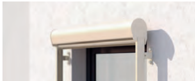
VS4300 Square or round box