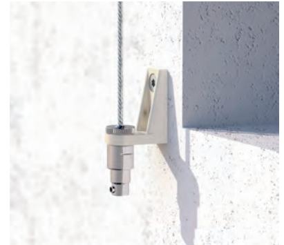
Wall bracket incl. spring chuck