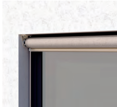
S4110 No box