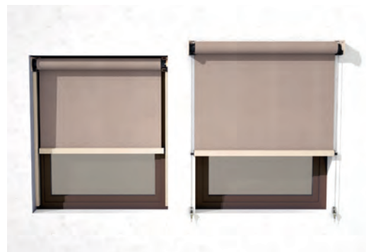
Aluminum rail and wire rope