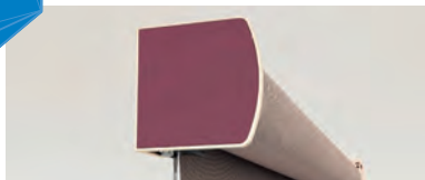
Cover panel available in one or two colors