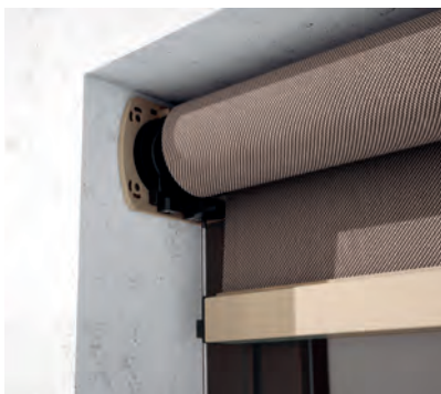
Niche mounting, soffit mounting