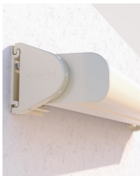
Round or square design