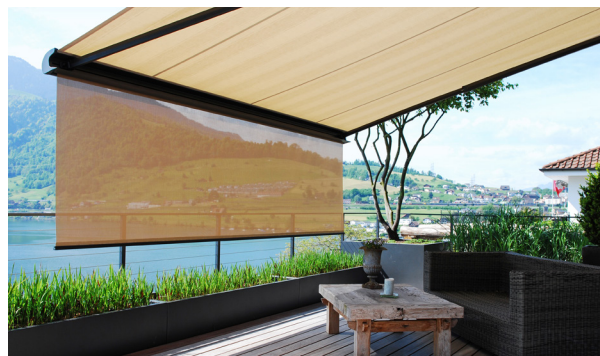
Drop down valance